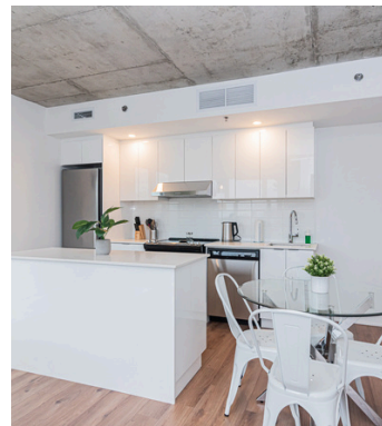
Modern equipped kitchen

An efficient, stylish space for cooking, dining, and gathering.