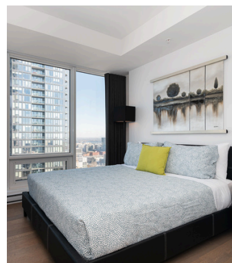
Spacious 2-bedroom suite

A fully equipped kitchen designed to combine comfort and conviviality.