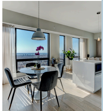
Elegant and practical kitchen

An efficient, stylish space for cooking, dining, and gathering.