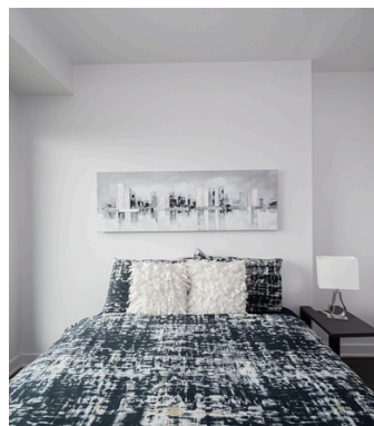
Private one bedroom

An efficient, stylish space for cooking, dining, and gathering.