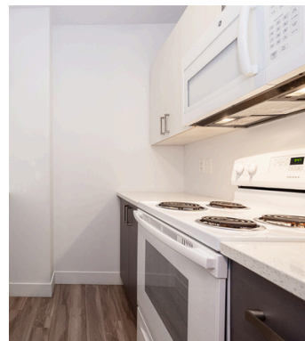
High-end kitchen appliances

An efficient, cozy space for cooking, dining, and gathering.