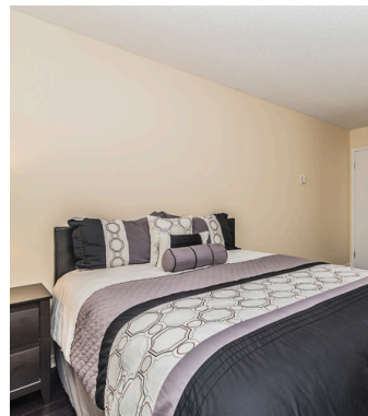
1 spacious bedroom

An efficient, stylish space for cooking, dining, and gathering.