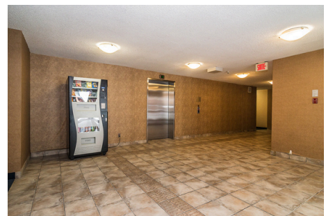
Grand Entrance Hall

A haven of peace for your walks and moments of relaxation.